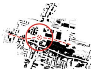
A4 corridor at the heart of Slough