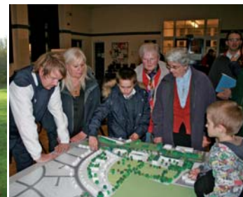
Physical model of the proposals prepared at the EbD