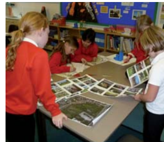
Working with local schoolchildren