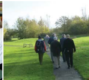
Walking around site with local residents