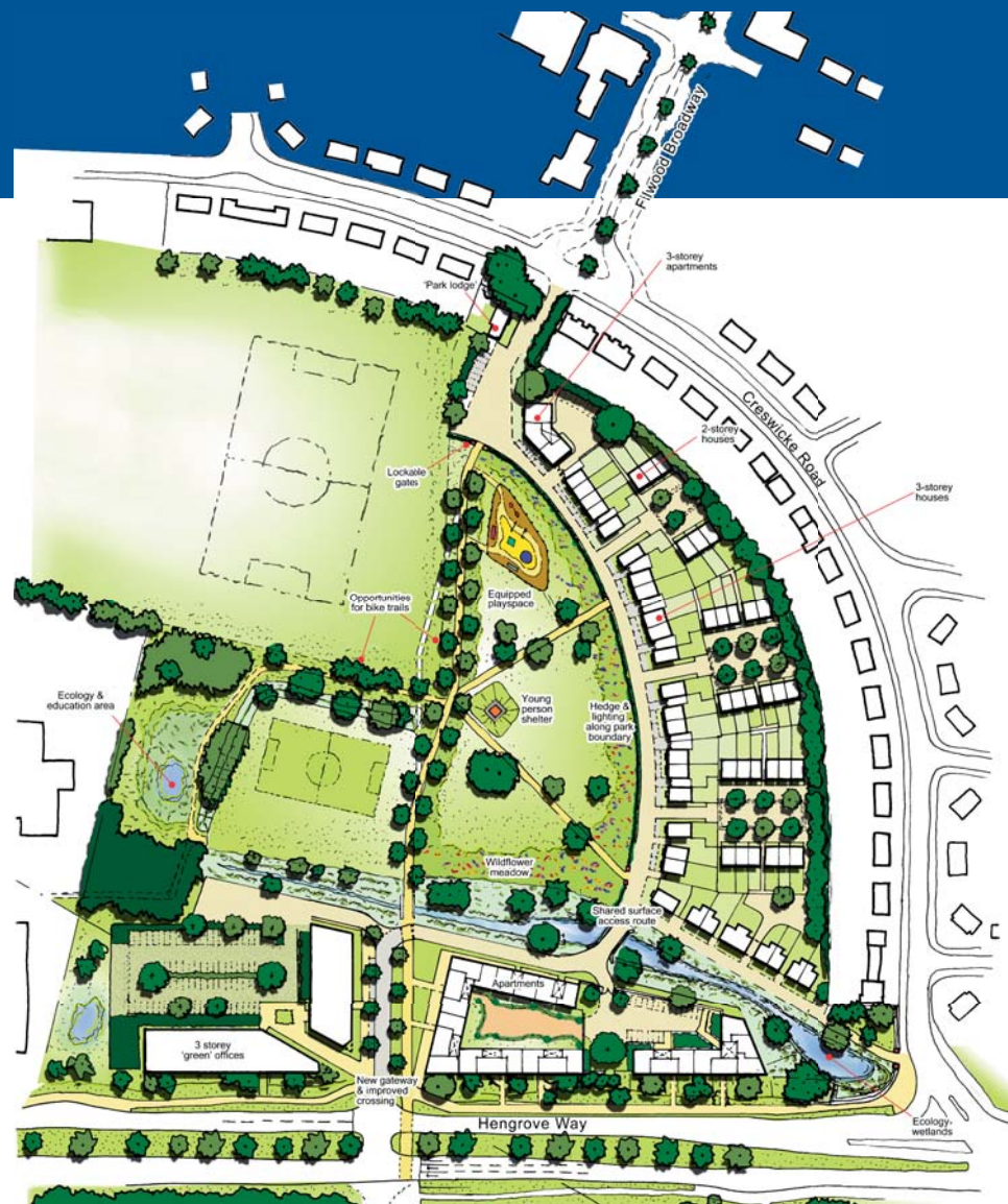
EbD Masterplan prepared with local residents

The masterplan will now be refined and a planning application submitted early in 2012. HCA funding is also available to deliver new infrastructure by April 2013.