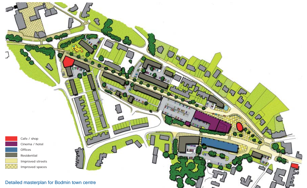
Detailed masterplan for Bodmin town centre