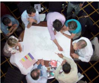
Stakeholder workshops in Bodmin Jail