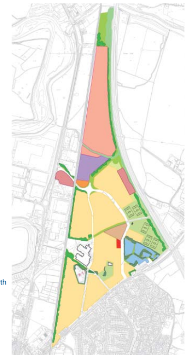
Land use plan for comprehensive masterplan including land to the north

A mixed-use urban extension for the Innovia land, promoting apartments, town houses, new office space, an Innovation Centre, retail, leisure and community facilities within a high quality public realm