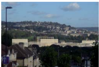
Assessing visual impact of previous schemes