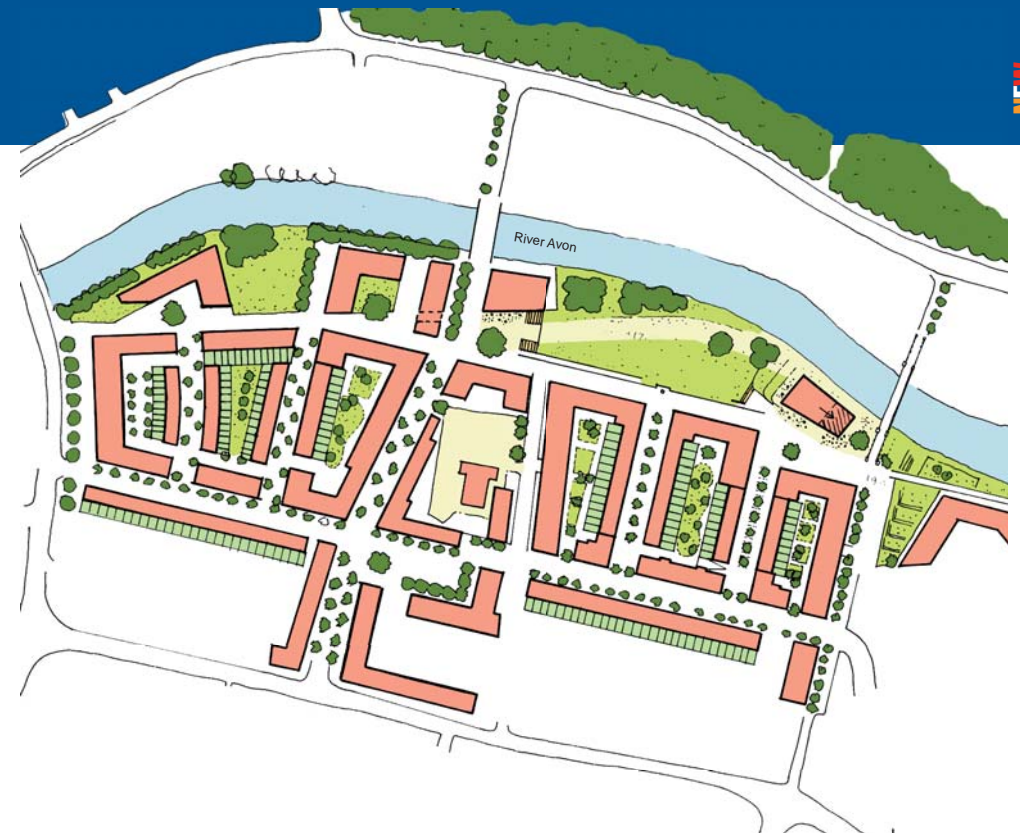
Alternative masterplan for Bath Western Riverside

As a result of our review HCA agreed to provide funding for the proposals. A planning application was submitted for over 2,000 homes and planning permission granted in late 2010. After being derelict for more than 25 years construction of Phase 1 at Bath Western Riverside is now underway.